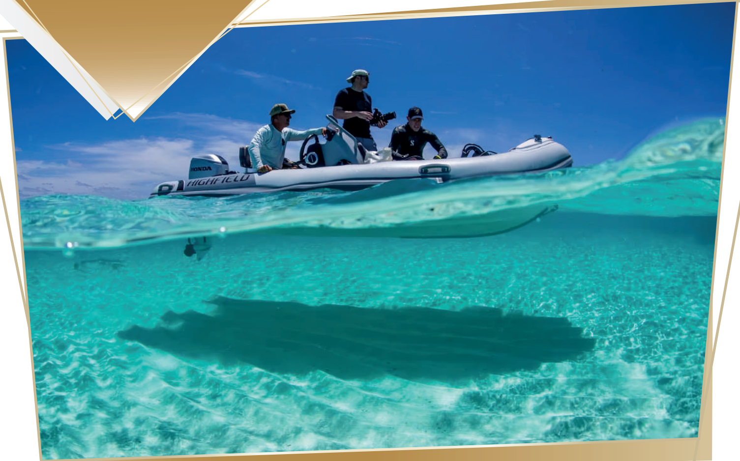
THE BOAT IS EQUIPPED WITH A TENDER HIGHFIELD®